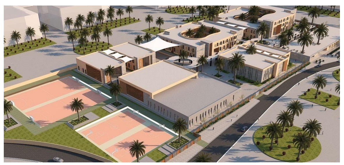
ASB future campus adjacent to UM6P